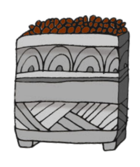
box of cacao beans