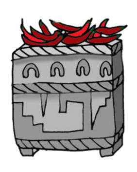
box of chili