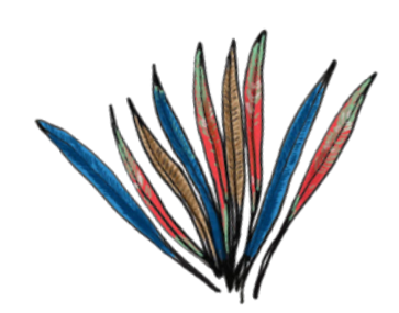
bunch of feathers