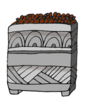
box of cacao beans