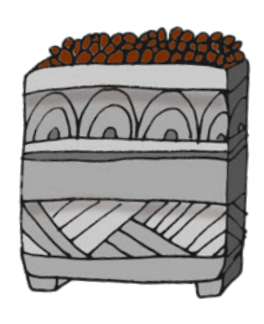
box of cacao beans