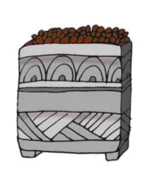
box of cacao beans