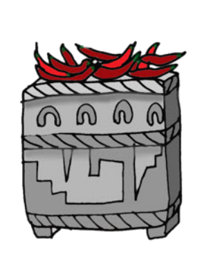
box of chili