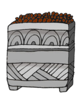
box of cacao beans