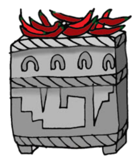
box of chili