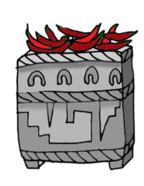
box of chili