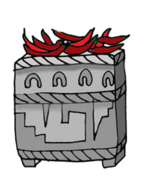
box of chili