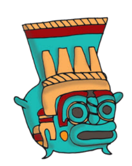
jar of honey