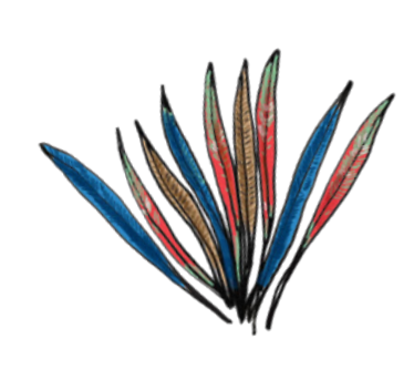
bunch of feathers