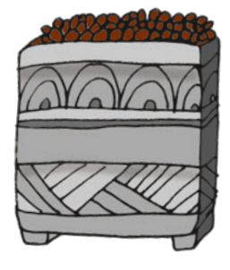
box of cacao beans